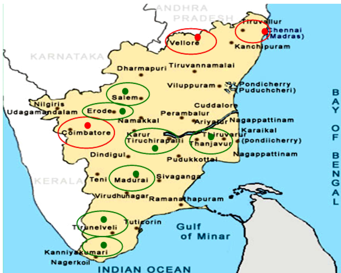
Figure 2 Geographical location of ST-elevation myocardial infarction clusters in the state of Tamil Nadu.

India; to help organise and train STEMI teams in hospitals; and to develop STEMI systems of care appropriate to the context of healthcare systems'