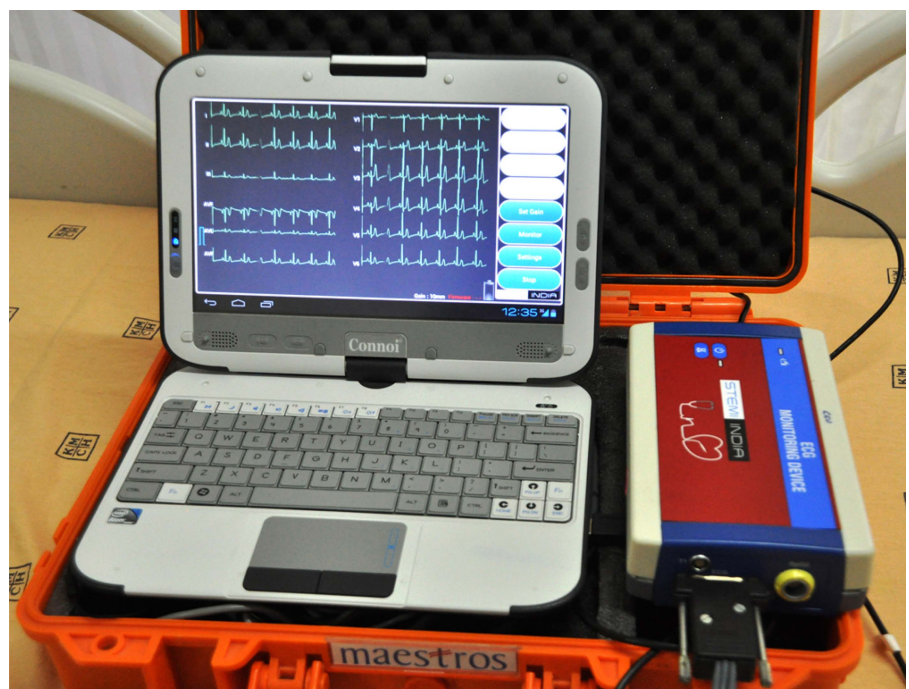
Figure 3 ST-elevation myocardial infarction kit.

The paramedic and STEMI coordinators will capture the patient demographic details along with a checklist for eligibility for fibrinolytic therapy. This information along with the ECG will be transmitted to the on-call cardiologist in that cluster to diagnose STEMI and decide on initial treatment. The on-call cardiologist receives an alert once these data are obtained. She (or he) can then go over the patient records, ECG and confirm STEMI. This in turn alerts the paramedic to transport the patient to the destination based on GPS navigation. A dedicated server will be available round the clock to route all information from one hand-held device to the other in ambulance or hospital. Data are simultaneously stored on the server along with the ECG snapshot which can be accessed by teams at the receiving hospital.